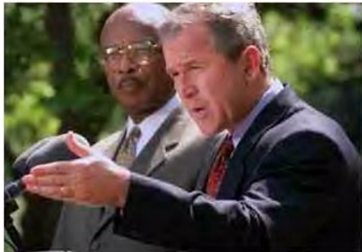
President George W. Bush with Education Secretary Rod Paige

For the latest developments on the new law, go to www.aasa.org and click on the "Issues and Insights" link.