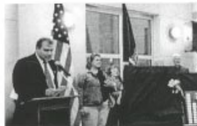
Willink Middle School Webster Central School District Webster, New York

Beardsley Design Associates has provided high efficiency sustainable designs for over 103 years.